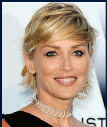
Sharon Stone Hosts Designer Handbag Auction For Lupus Foundation