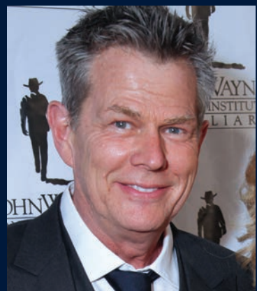
Music Impresario David Foster Performs at JWC Gala