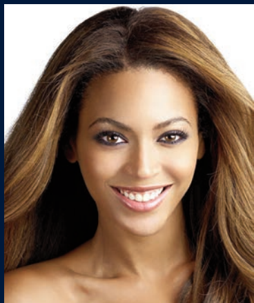
Sneak Peek 2013 Horoscope For Our Favorite Stars Beyoncé